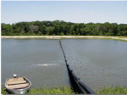
PREVENT SHORT CIRCUITING