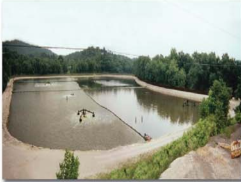
CREATE MULTICELL LAGOONS